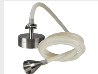
Remote ISP Sampling Kit