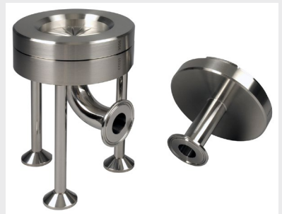
Isolator Monitoring Kit