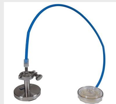
Remote connection to BioCapt® Single-Use

Makes the Job Easier – The MiniCapt Mobile Microbial Air Sampler simplifies the job of microbial air sampling by applying modern data management capabilities that save time and reduce operator error in air sampling data. The sampler incorporates a capacitive touchscreen, allowing easy use with gloves without the need for a stylus.