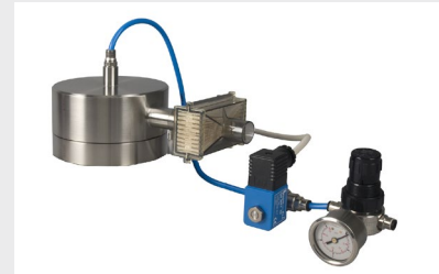
Compressed Gas Sampling Kit